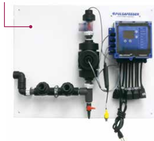
STANDARD PANEL AND FLOW ASSEMBLY