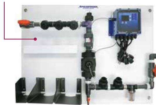
PANEL-MOUNTED WITH PUMPS