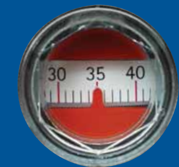
Detail of Analogical reading (1% steps).