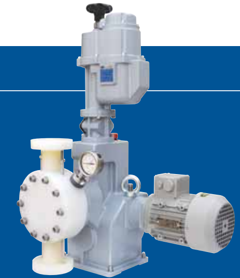
Z type actuator vertically fitted on XL pump (hydraulic diaphragm to API 675 STD).