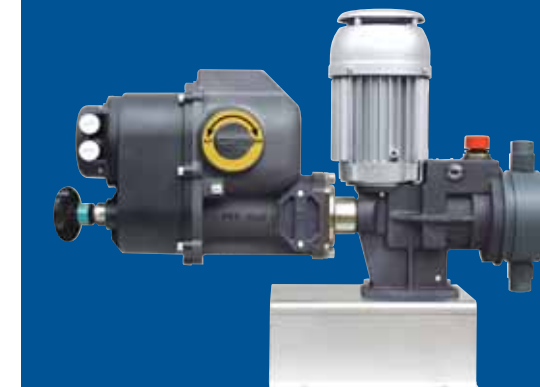
Z type actuator horizontally fitted on XRN pump (hydraulic diaphragm).