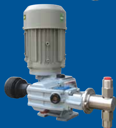
Pump type RCN 6A 70 TL

These pumps are designed to handle EXTREMELY LOW FLOW RATES where continuous dosing is required. These packed plunger pumps are able to control down to addition levels of 15 ml/h (0.04 GPH) at a maximum pressure of 40 bar g (600 PSI g) due to the unique OBL packed plunger design and the use of exotic materials for valves components.