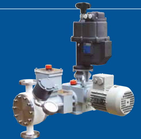
Z type actuator vertically fitted on LX9 pump (hydraulic diaphragm to API 675 STD).