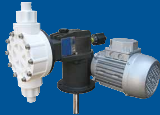
Pump type MHBN100 PP

OBL is a world leader in the manufacture of metering pumps for FILTER AIDS , used for wine, beer and fruit juice filtration. These are diatomaceous earths known as Kieselgur. A range of pumps is available including lip seal plunger pump, mechanical diaphragm and hydraulically actuated diaphragm. These meet the general requirements for flow rates and pressure (100 litres per hour, 26,5 GPH at 10 bar g, 145 PSI g).