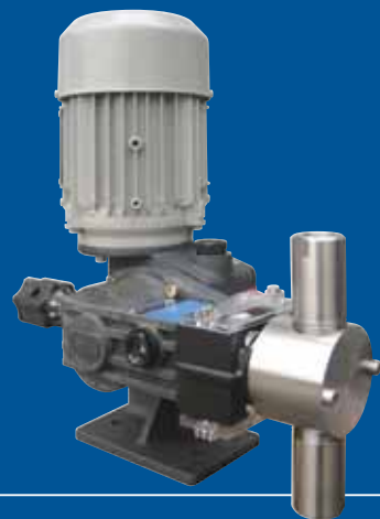
Pump type RCC 16 HV 50 DV

Specifically designed to handle high VISCOSITY PRODUCTS the HV pumps are available in packed plunger version only with either spring or positive return mechanisms. These pumps are capable of handling products with a viscosity up to 55,000 cP with each head capable of achieving flow rates of up to 150 l/h (40 GPH).